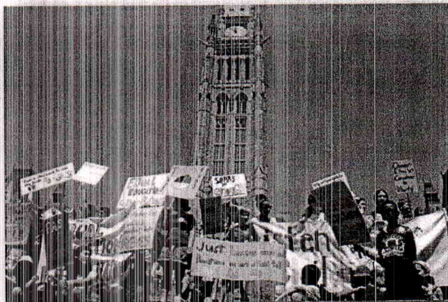
Aboriginal and non-Aboriginal children walk to Parliament Hill on June 11, 2012 for equity for First Nations children

ADDITIONAL INFORMATION FOR CANADA'S LIST OF ISSUES